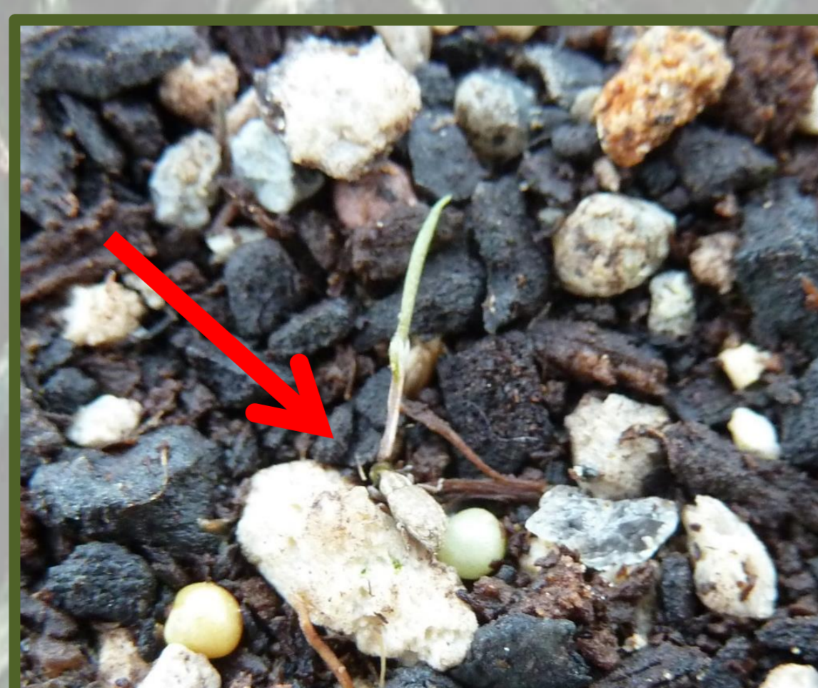
Fig. 1: Adult Argentine stem weevil feeding on the base of a developing perennial ryegrass seedling infected with a known peramine producing endophyte strain.