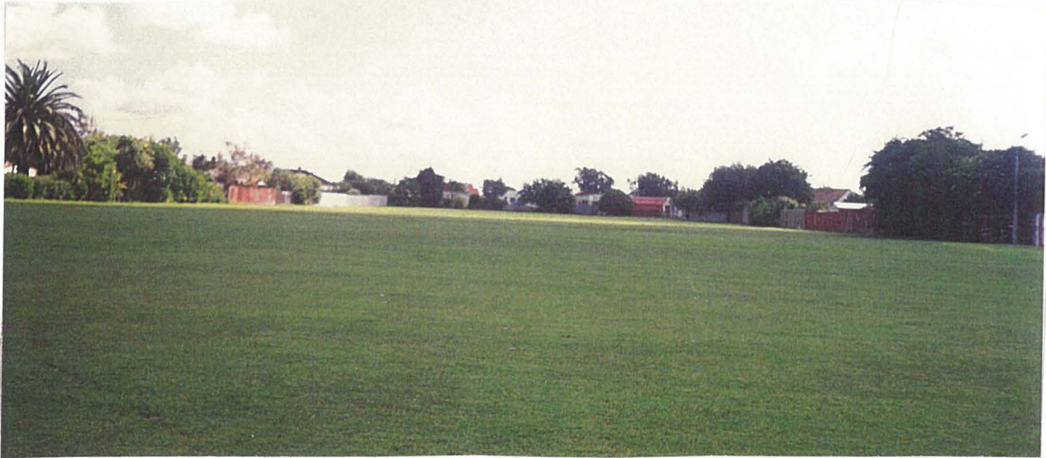
The precinct's College Street, Cook Street, intersection.

The central reserve in Savage Crescent was initially used to grow vegetables during World War Two. Since then, it has only been used for recreation.