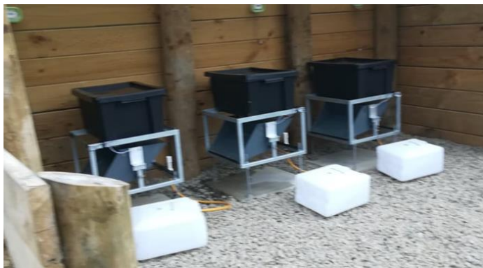
Figure 2: Individual tipping buckets and collection area for drainage water