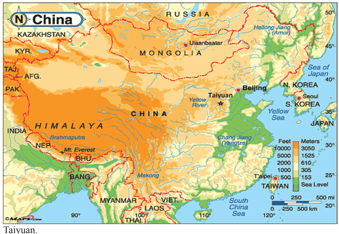
Figure 1.1 Map of China

China is vast in territory and its topography is varied and complicated. Different regions have different quantity of sunlight. Taiyuan city is a typical industrial city, which is located in Loess Plateau in north China (Figure 1) and 38 degrees north latitude. Its climate is typical mainland monsoon and has four distinct seasons. In winter, the maximum and the minimum temperatures are 5 degrees above zero and minus 10 degrees below zero, respectively. The average daily sunshine duration in winter is about 5.5 hours. The city also lacks special locations and facilities for the large population to do outdoor exercises. Together with the heavy air pollution and haze in winter caused by industry and burning coal for heating, the city surroundings are not suitable for outdoor physical activity. Therefore, it is of interest to investigate the vitamin D status of residents living in Taiyuan City. However, as far as the current author knows, there have been no studies evaluating their vitamin D status. The present study determined the serum vitamin D concentrations of 200 adult volunteers, to provide an initial evaluation of the vitamin D status of people living in