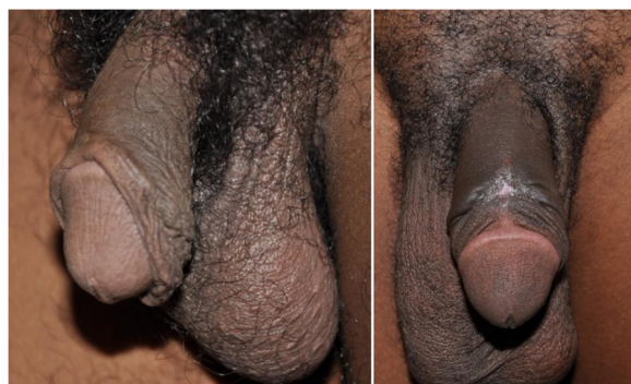
Figure 2 Longitudinal Foreskin cut: Variant (i) Foreskin cut but still partially covers the glans penis; Variant (ii) Foreskin cut and remains loose behind the glans penis.

MC for children was viewed positively. More than 90% of men and three quarters of women stated they would